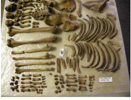
Fig: 34.1 and 34.2

Sex : male (morphological diagnosis, on the basis of the most discriminant features).