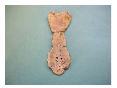
Fig: 75.2 Fig: 75.3 Fig: 75.4

- The enamel hypoplasia indicates repeated nutritional or pathological stresses beginning from the age of 3-4 years i.e. the period of formation of the cervical part of the incisors.