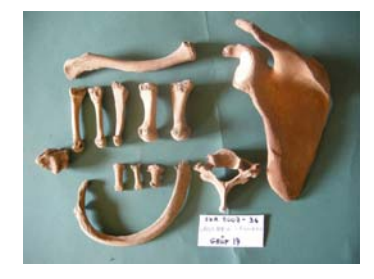
Fig: 17.4 Fig: 17.5 Fig: 17.6

Signs of arthritis can be observed at the shoulder, elbow and hip joints, as marginal lipping, and on the 3rd, 4th and 5th thoracic vertebrae, as sclerosis of the plates, deformation of the intervertebral facets, marginal lipping, lowering of the bodies.