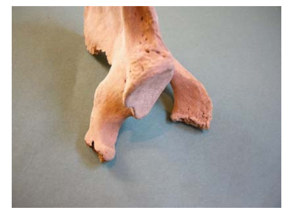
Fig: 80.2 Fig: 80.4