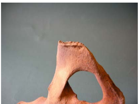
Fig: 17.2 Fig: 17.3

On the left femoral neck the "anterior cervical imprint" can be observed, as a fossa surrounded by a ring of reactive bone (Fig.17.4). It is considered by some authors the trace of a hyperextension of the femur, as during walking on mountains, while some other authors attribute it to a hyperflexion of the femur, as when squatting.