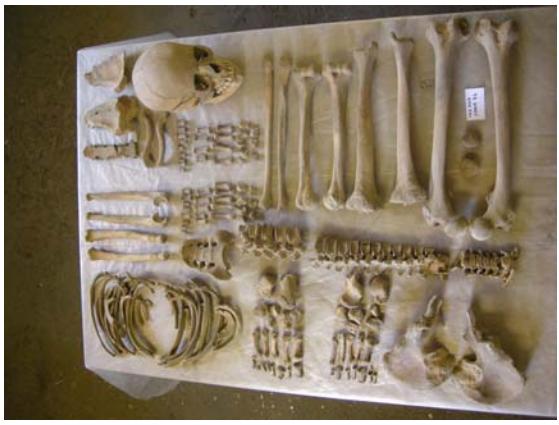
Fig: 54.1 Fig: 54.2

Sex: male (morphological diagnosis, on the basis of the most discriminant features).