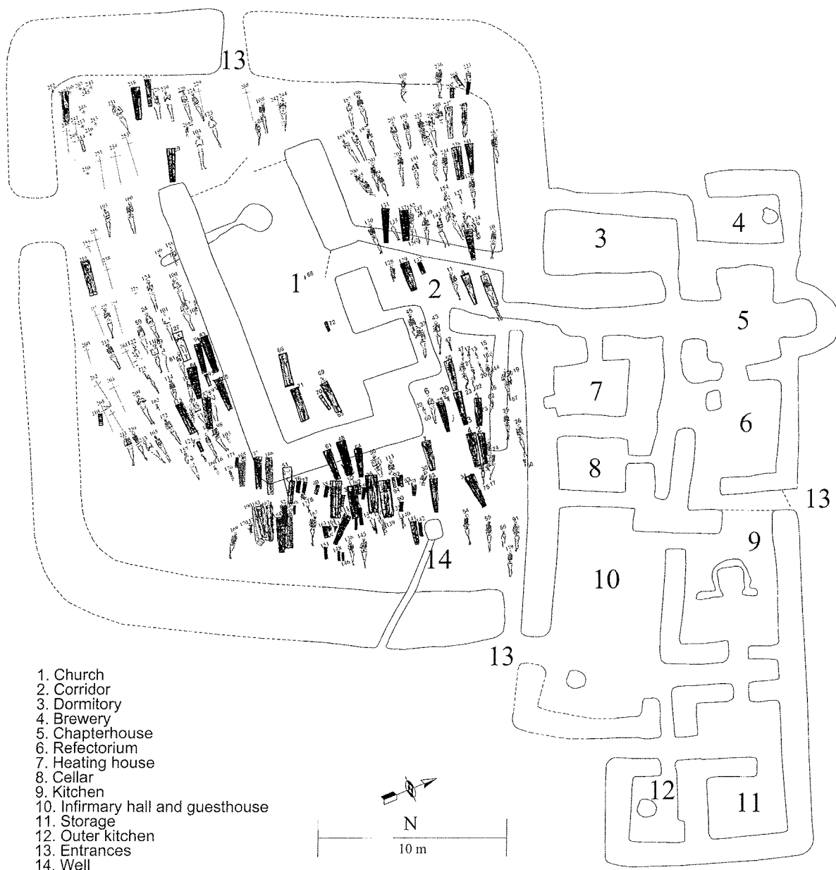
Fig. 1: The Ruins of the Skriðuklaustur Monastery.

terials – turf, stones, and driftwood – the interior plan of its buildings is typical, forming a cluster of houses with different areas divided accordingly to sacred and secular purposes. The south area of the monastic complex was formed by the church, the western by brethren's living quarters, the northern by the kitchen and refectory area, but the infirmary hall, the guesthouse, and the storage rooms are all located in the eastern part of the complex, farthest away from the sacred space of the brethren. The church was enclosed by a wall that was attached to the northern wall of the monastic houses. Inside the